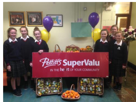
Fruit supplied by Pettitt's SuperValu.

The activities and events that took place as part of our positive mental health week included knit-n-natter, our worry tree, daily prizes, yoga, drop-n-dance, skipping, one moment meditation, drop-n-talk, a sensory walk and free fruit supplied by Pettitts.