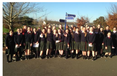
Our lunchtime Sensory Walk group.