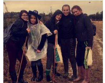
Enjoying the muck and rain at the Ploughing.