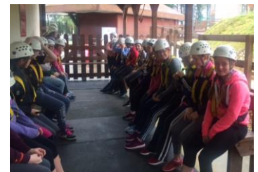
Some very nervous looking TY’s at Gravity.