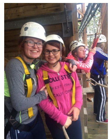
TYs enjoying themselves at Gravity.