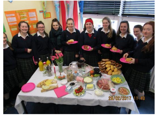
Sixth Year German breakfast.