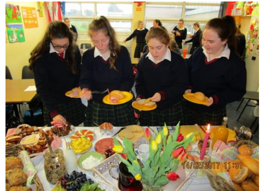
Fifth Year German breakfast.