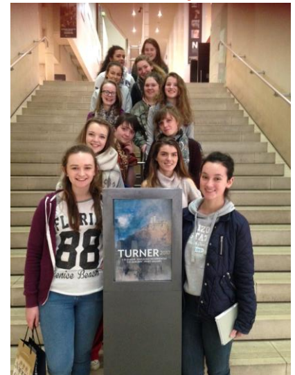
Our Sixth Year Art students on an Art trip to Dublin.