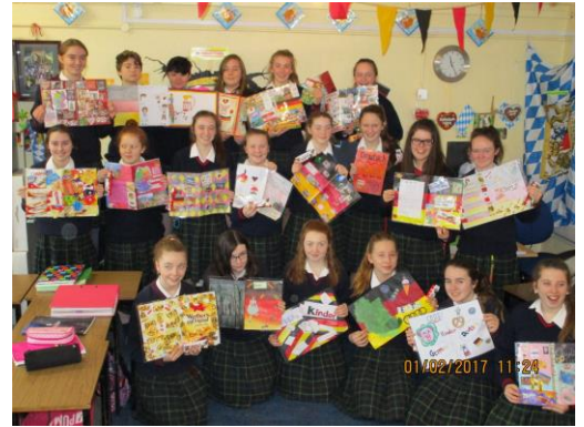
Second Year German copy-cover-decorating competition.